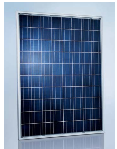
SCHOTT POLY™ 280/290/300