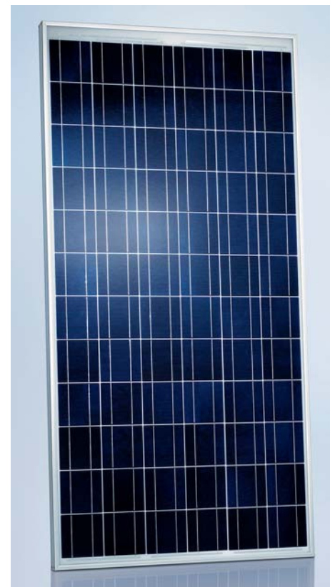
SCHOTT POLY™ 165/170/175/180